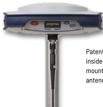
Patented inside-the-rod mounted UHF antenna design